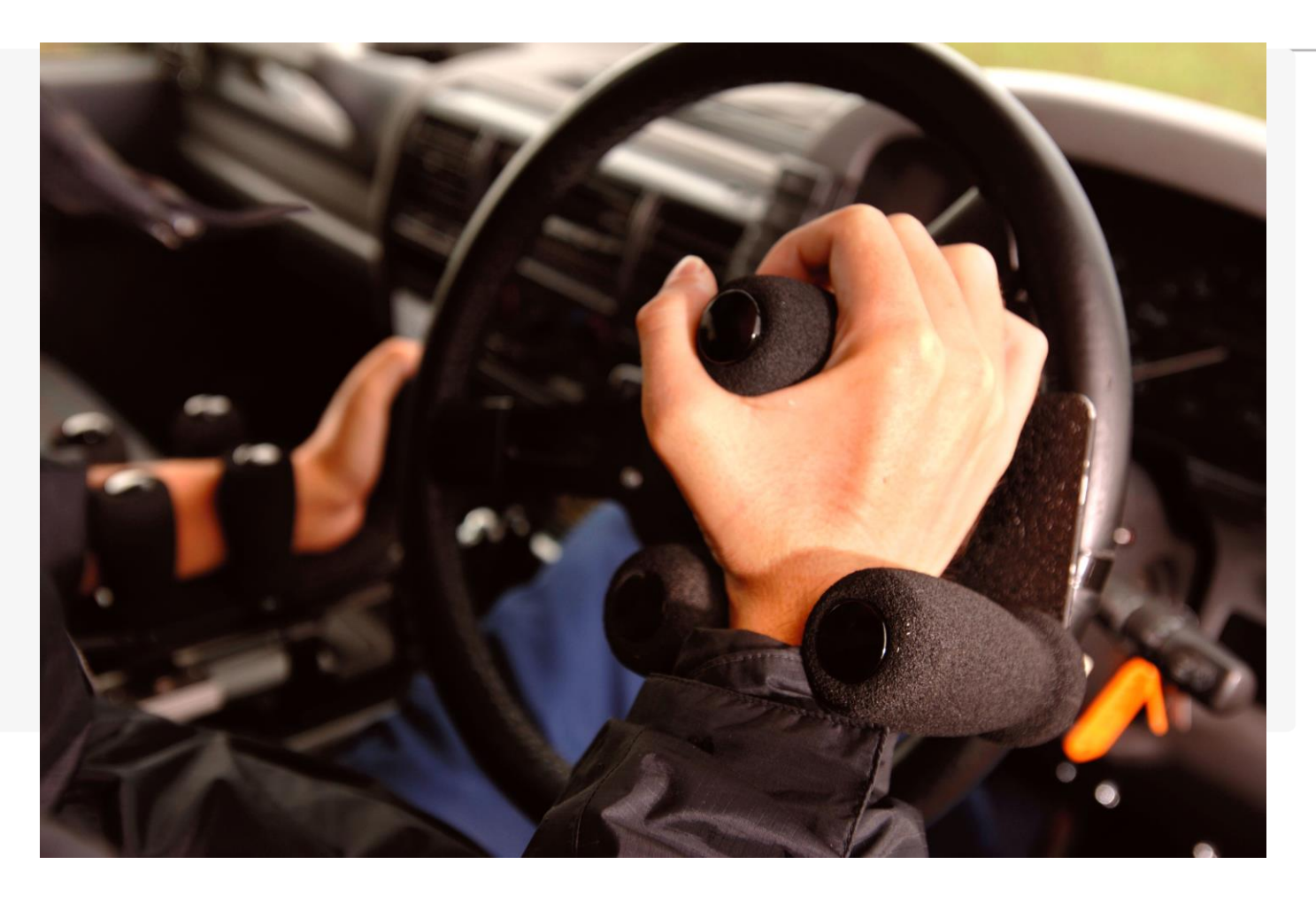
Disabled Road Users 06 September 2022