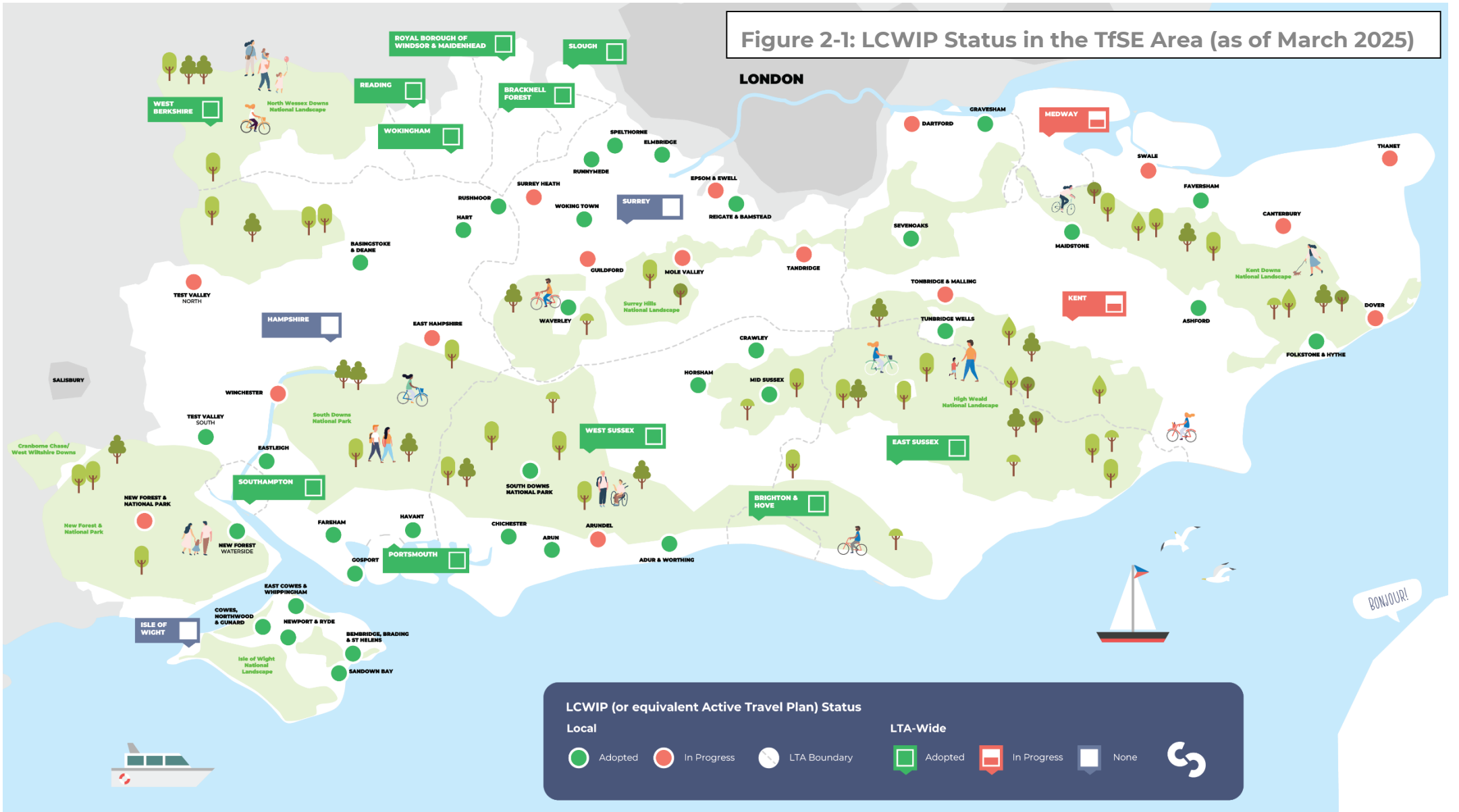
Figure 2-1: LCWIP Status in the TfSE Area (as of March 2025)