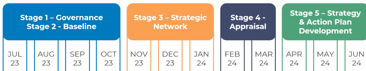
Figure 1-1: Project Stages of developing the TfSE Regional Active Travel Strategy and Action Plan