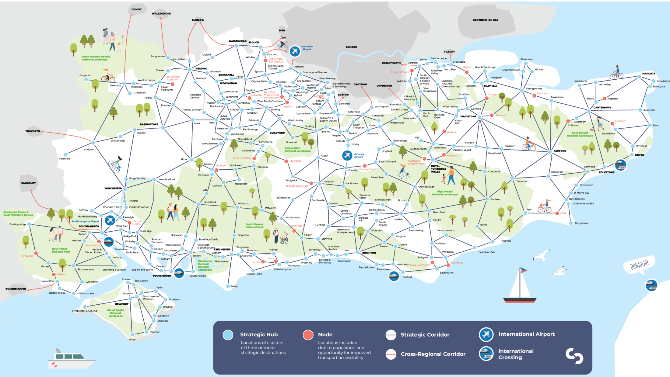
Figure 3-1: Strategic Active Travel Network for the TfSE Area

This is an aspirational and indicative network that will be updated as appropriate.