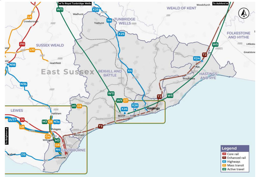
Figure 1: Bexhill and Battle; Hastings and Rye; Eastbourne schemes from TfSE's Strategic Investment Plan

To the right, we have mapped the prioritised schemes for Bexhill and Battle, Hastings and Rye, Eastbourne and the surrounding area; the schemes within the Strategic Investment Plan will be delivered from now to 2050.