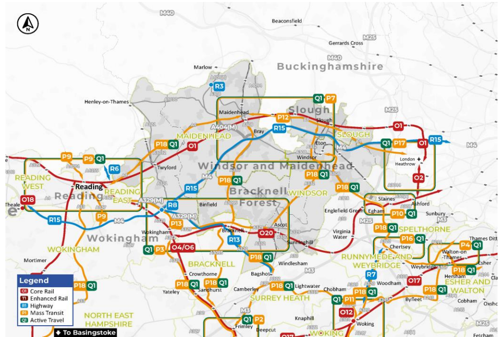
Figure 1: Maidenhead; Slough; Windsor schemes from TfSE's Strategic Investment Plan

To the right, we have mapped the prioritised schemes for Maidenhead, Slough, Windsor and the surrounding area; the schemes within the Strategic Investment Plan will be delivered from now to 2050.