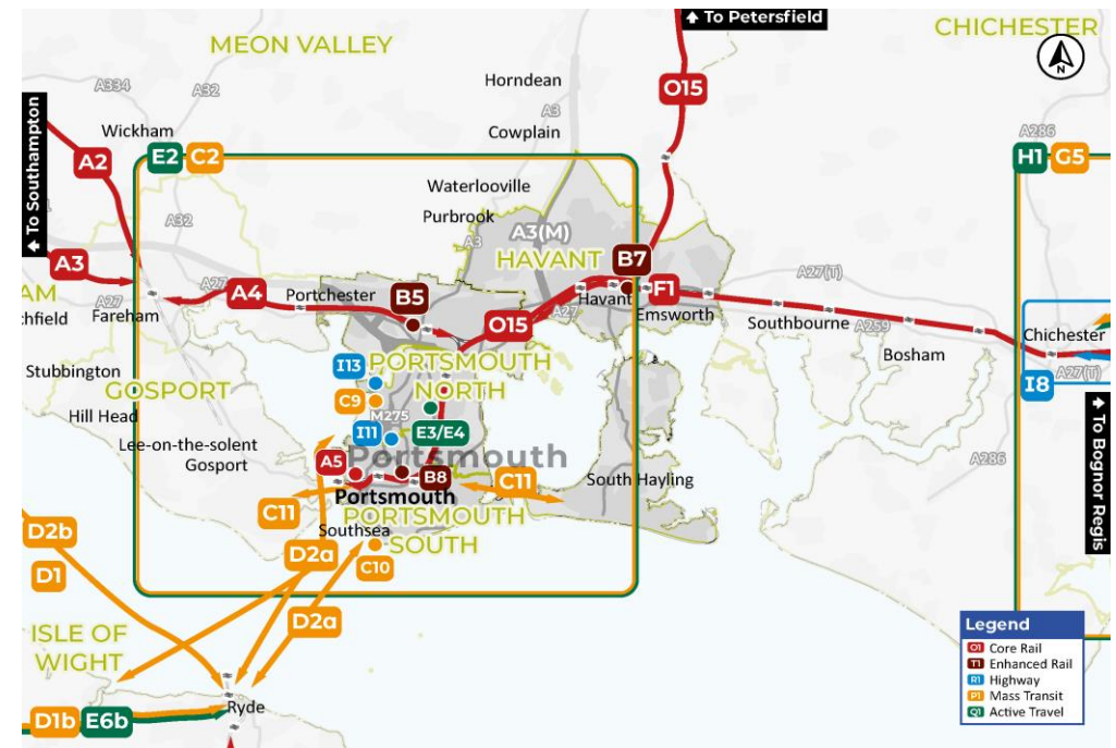
Figure 1: Havant; Portsmouth North; Portsmouth South schemes from TfSE's Strategic Investment Plan

To the right, we have mapped the prioritised schemes for Havant, Portsmouth North, Portsmouth South and the surrounding area; the schemes within the Strategic Investment Plan will be delivered from now to 2050.